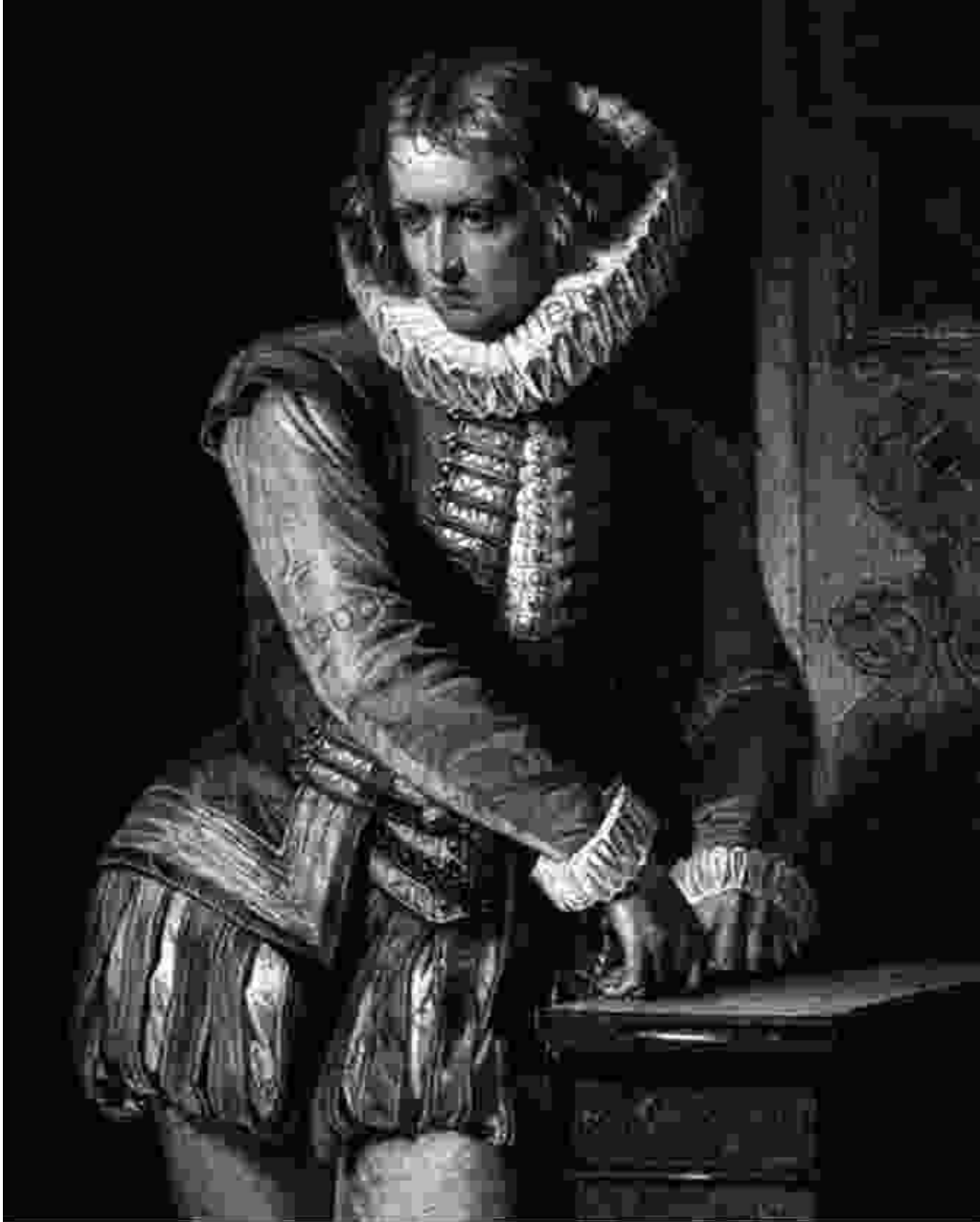
Illustration from Schiller's play 'Don Carlos'