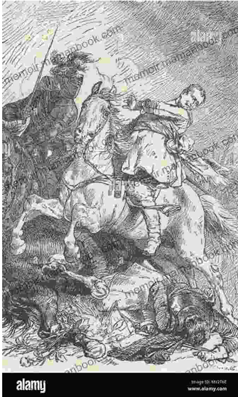
Illustration from Schiller's work 'History of the Thirty Years' War'