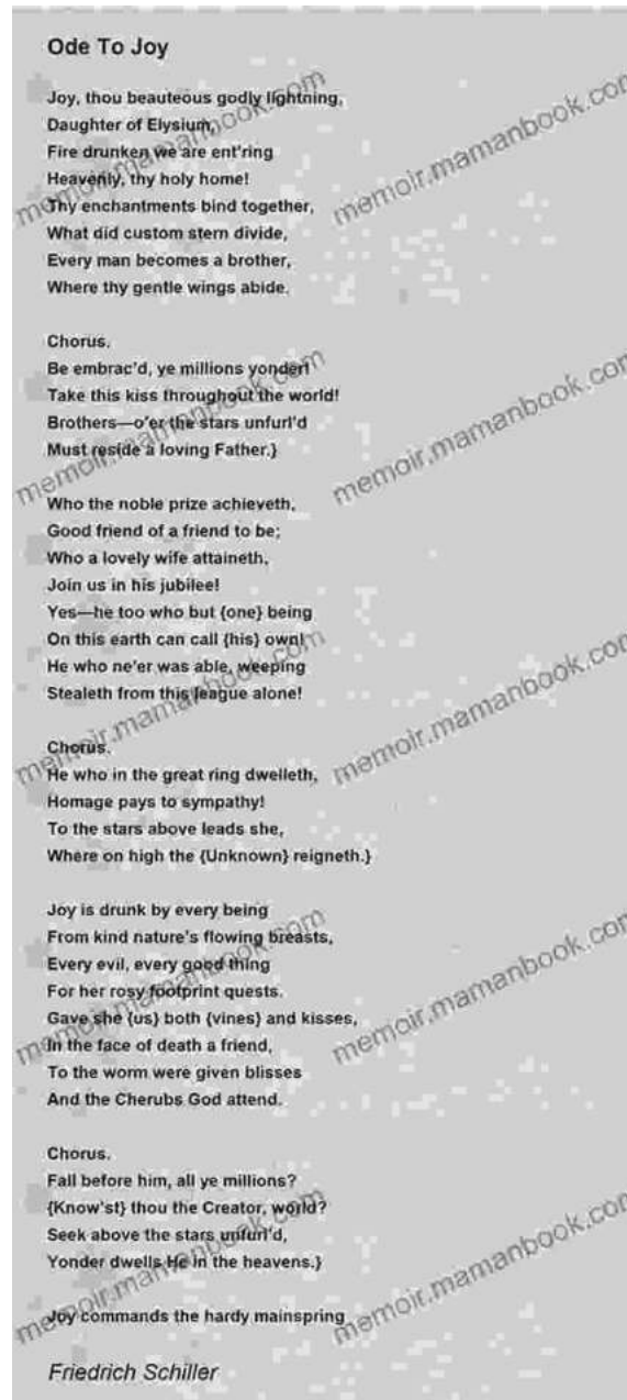
Illustration from Schiller's poem 'Ode to Joy'

of life. In later works, such as "The Song of the Bell" and "The Ideal and Life," he explores themes of human destiny, morality, and the search for meaning in a changing world. Schiller's poetry invites readers to contemplate the human condition, inspiring reflection and introspection.