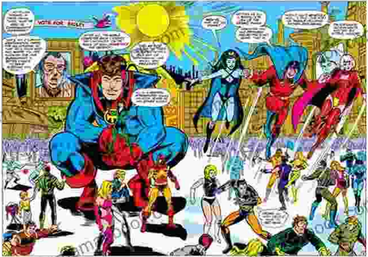
The Legion of Super-Heroes in the 1980s.